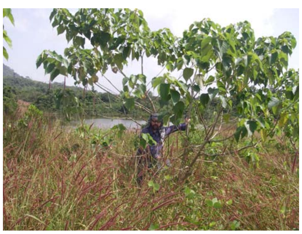
Plot 3 – June 2007