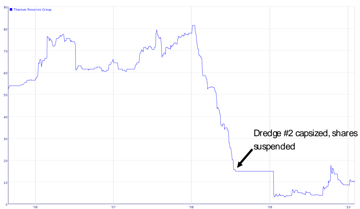
Figure 2. Effect of the "credit crunch" on the share price of Titanium Resource Group (who own SRL)

The concept of biodiversity offsets was explored with mining officials and while interested in the theory they were always wary of the costs. Following the economic crunch of 2008-09 (figure 2) it is clear they do not intend to take the concept further at this time.